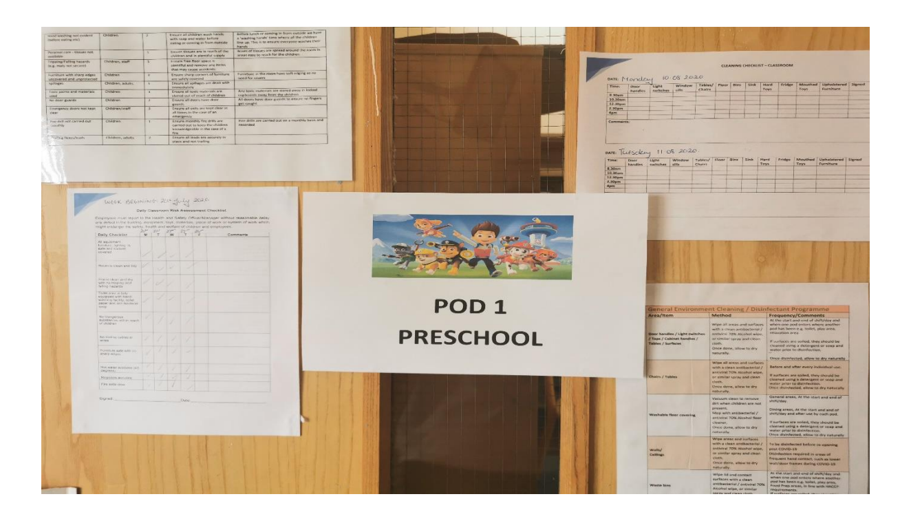
Play Pod 1

As a community-based pre-school/afterschool service our setting consists of a large, bright and airy community room which doubled as a pre-school and afterschool room for the children pre-Covid 19. This room is now divided into 2 Play Pods (Pod 1 – Pre-school and Pod 2 - After school). We continue to use our key worker system, playing outdoor daily was always the norm (Pod 1 – outdoor space and Pod 2 Public playground at the front of the service) and each team member knows their role and those of their co-workers within their pod.